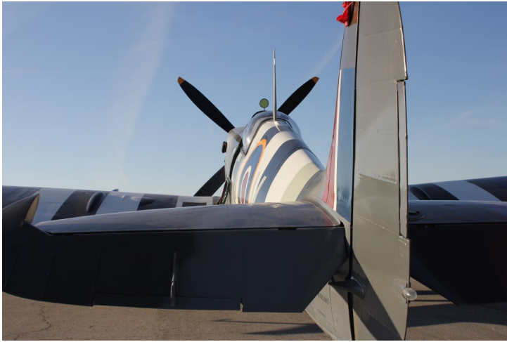
Very beautiful and original Spitfire