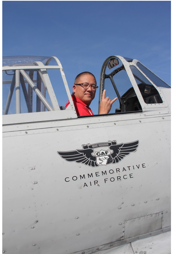
Me sitting in my friend's CAF Hollywood Zero (T-28).