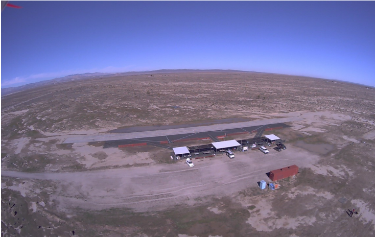
Ariel shot of the field