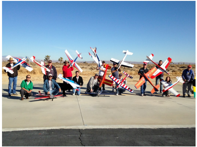
Classic-Pattern Pilot Line-Up