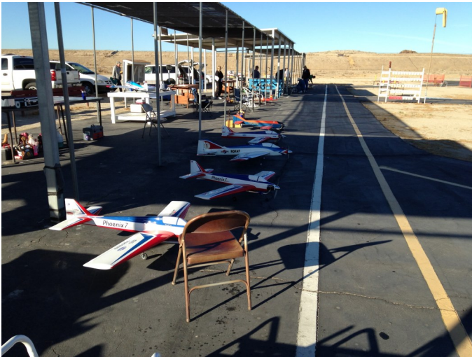
The line-up at the Classic-Pattern Championship