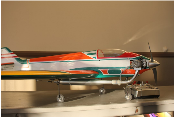
Jamie's new Pattern Bird