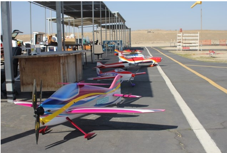
AVTI Flight-Line May 2013