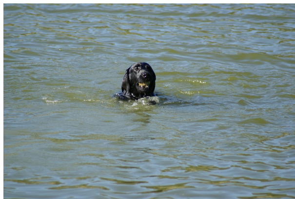
Barkly enjoying a summer swim

The club is soliciting suggestions and comments on all club matters. Members are invited to send in suggestions on any subject. The suggestions may be sent in on-line by going to the club web site ( www.avti.org ) and emailing the webmaster.